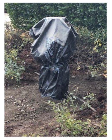
Fire hydrants that are not in service yet, shall be covered with a black plastic bag . Once the hydrants are in service the plastic bag will be removed.

Please do not move the stake from its designated location. If you notice a stake has been moved or knocked down, please contact us immediately so that we can coordinate with the contractor. The Inspector or the Project Engineer will then restake at the proper location.